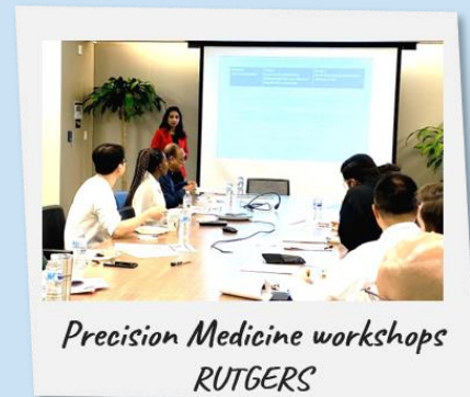
Precision Medicine workshops RUTGERS